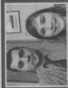
A Day in the Life of a Vice-Principal

Hey Kids... this is about a science experiment... a really fun science experiment! Just use your imagination. Every time people do science, they use their imagination. Most people like science because you can use different kinds of objects like carrots or snow, rocks and all kinds of things. We built snowmen and they looked awesome but the next day we came back to school and they were melted into a liquid. Over the weekend the liquid started to turn into gas. There was a little bit more water left so we put it in a bucket and placed it in the freezer to freeze overnight. The next day, even the bucket was frozen. It was really cool because everything was so cold! We learned that water can be in many different states...liquid, gas and even a solid!